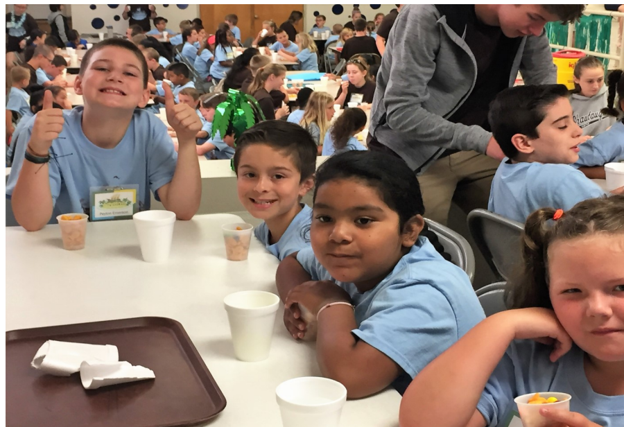
ALL THE TRIBES GET TOGETHER FOR TROPICAL TREATS