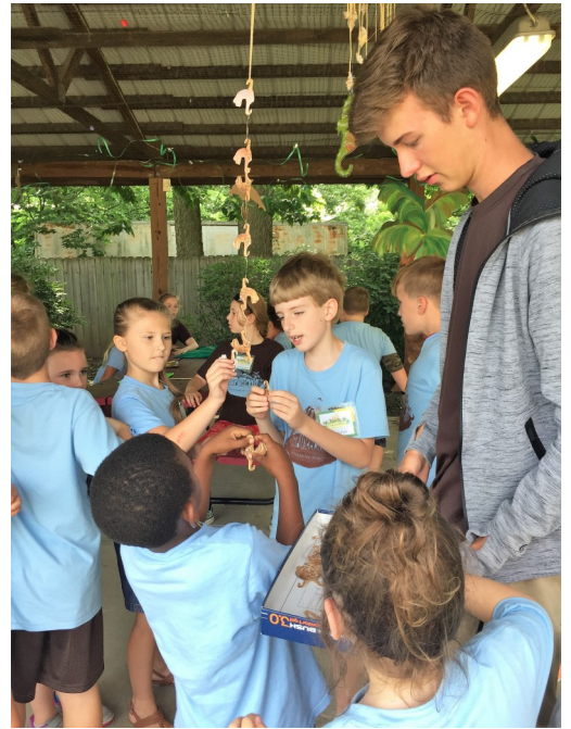
CHAIN OF MONKEYS AT IMAGINATION STATION