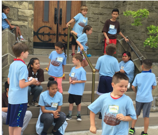
TRIVIA GAME AT SHIP WRECK GAMES