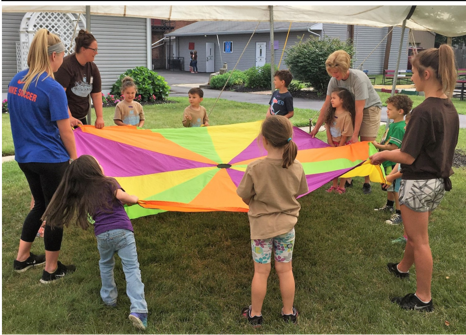
PARACHUTE WAVES AT PRESCHOOL TIDE POOL GAMES

Shipwrecked! Rescued by Jesus! Find lots more great photos at