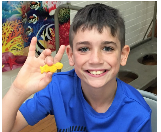
A FAVORITE TREAT - GOLDFISH!