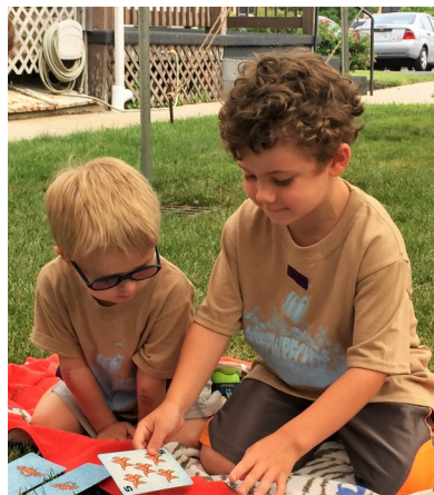
MATCH GAME FUN